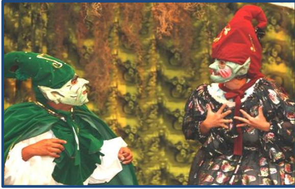
Theater: "Tecum Umanii Group"